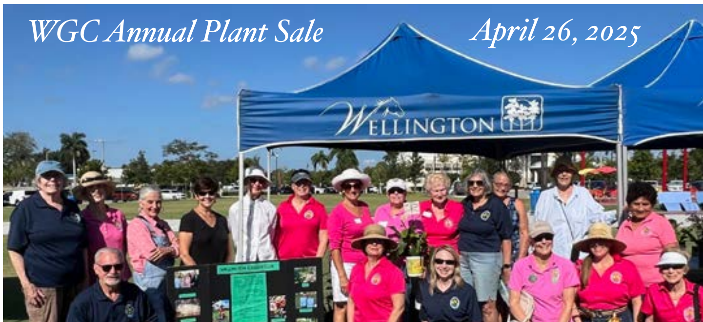
Our Group of Fabulous Volunteers