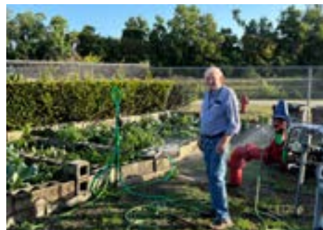
Teacher Helps Students Grow Veggies at PBCHS