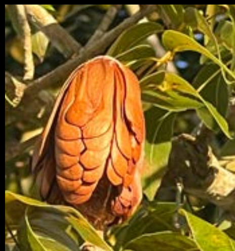
The seeds on my neighbor's mahogany tree this spring. —Katherine Wagner-Reiss