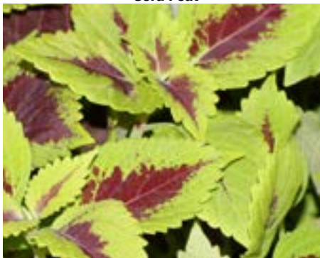
Stormi's Blue Ribbon Coleus