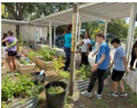
Equestrian Trails El Gardens 2025