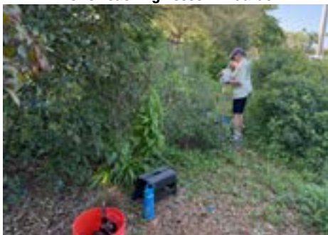
Scout Butterfly Garden