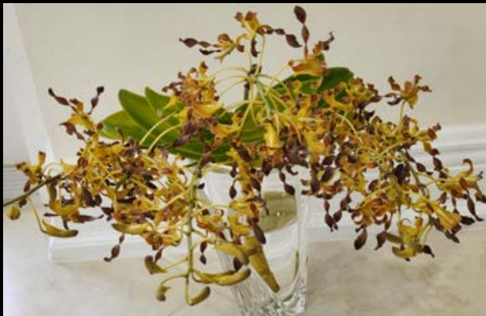
Just one frond from Dendrobium Discolor x Gouldii HR 23690. There are 7 spikes and about 70+ flowers. The whole huge plant grows on a cabbage palm trunk. —Adrienne Bendich