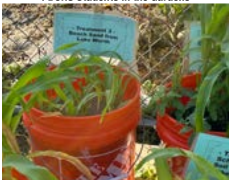
PBCHS Teaching Lesson in Garden