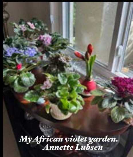
My African violet garden. —Annette Lubsen