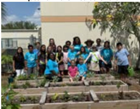
Equestrian Trails Garden Kids, Teachers & WGC Volunteers