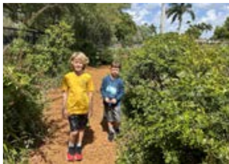
Scouts at Work in Butterfly Garden

Thank you to Wellington Garden Club members for supporting our Youth Garden Clubs and thank you to the youth garden committee members.