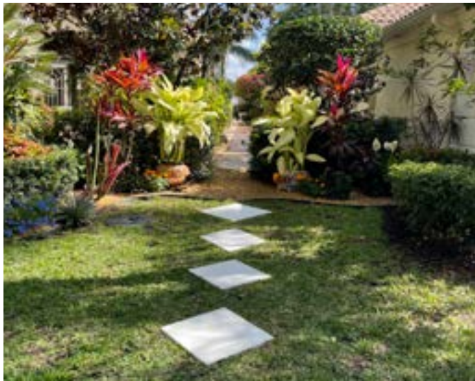
Enter the Garden Here