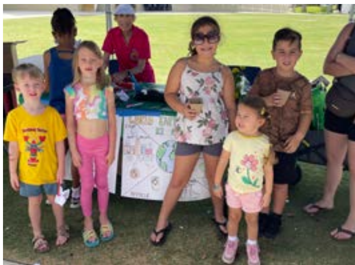
Big Success with the Kids...Planting Seeds.