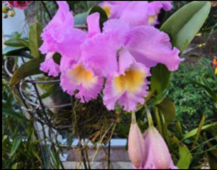
The first orchid, a cross of more than two genera, Rhyncho laeliocattleya (Rlc.) Hawaiian Agenda 'Florida winter' has 10 huge blooms (each 6 in wide and 8 in long) and has a light, floral fragrance.

The month of January, even though it was cold, resulted in several fragrant orchids blooming in my garden. —Adrienne Bendich