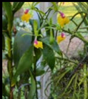
The fourth orchid is a cross that has not been given its own name yet. It is Epicattleya Dark fire x Pseudoepidendrum .

Each flower feels like plastic and can last for months.