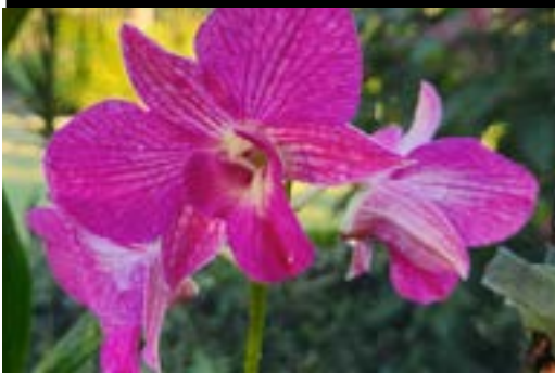
The third orchid is Den. Hawaii stripes. This is the first time it has bloomed since we bought it in 2019 as a small plant.