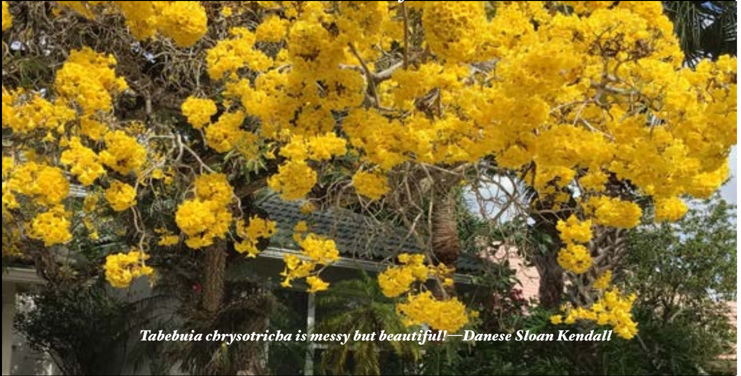
Tabebuia chrysotricha is messy but beautiful!—Danese Sloan Kendall