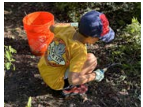
Scouts, leaders and parents mulching and weeding.