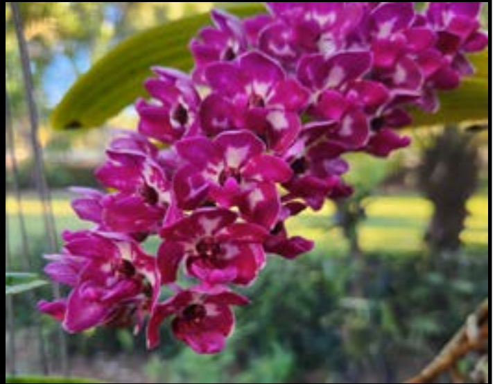
The second is also a mix of genera: Rhynchostylis gigantic red has 2 spikes and more than 50 blooms and has a spicy fragrance.