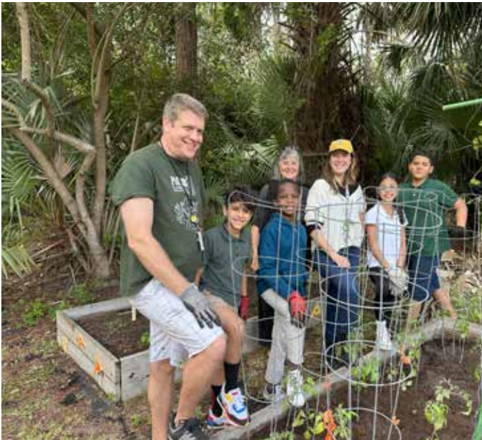
Pine Jog Elementary teachers, WGC volunteers and garden kids.