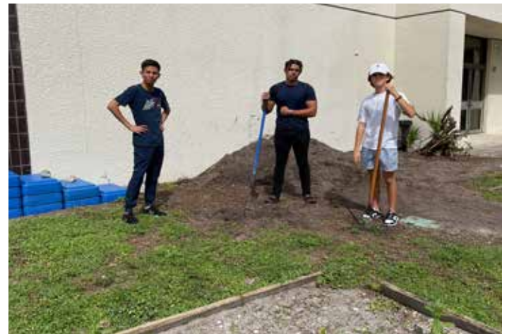
Wellington High School Garden Club Students digging new beds.