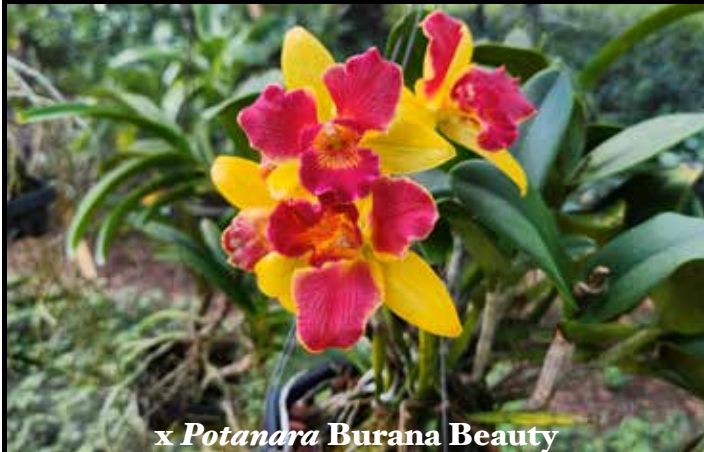
x Potanara Burana Beauty