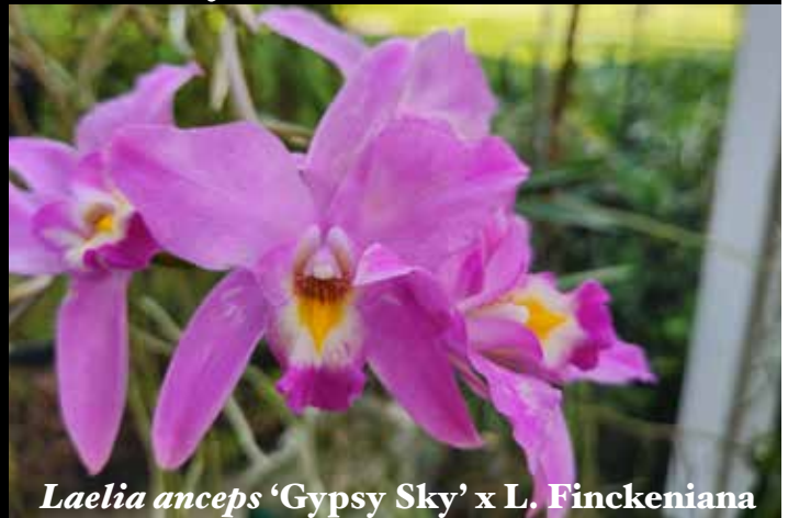
Laelia anceps 'Gypsy Sky' x L. Finckeniana