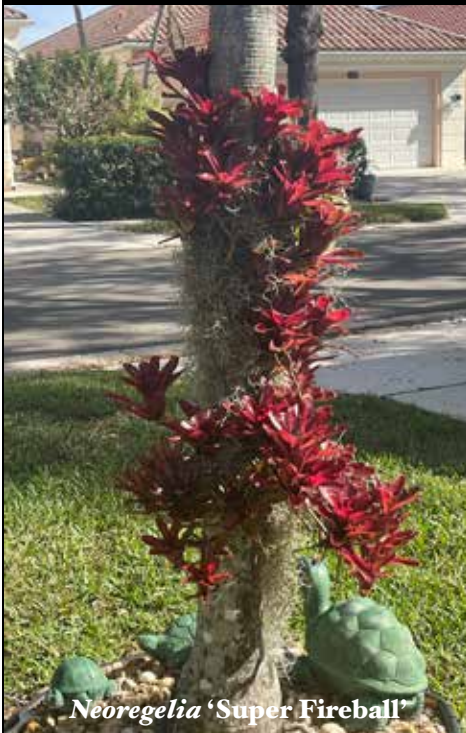
Neoregelia 'Super Fireball'