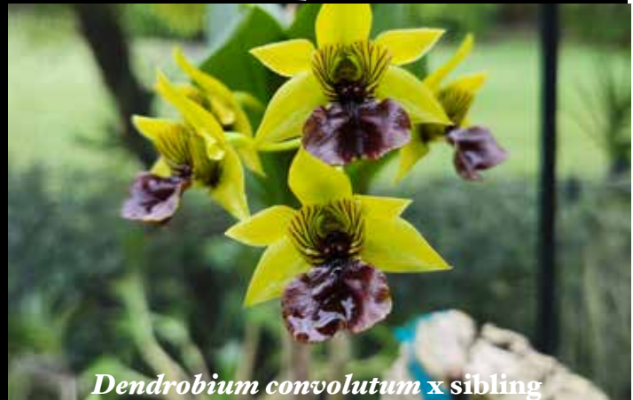
Dendrobium convolutum x sibling