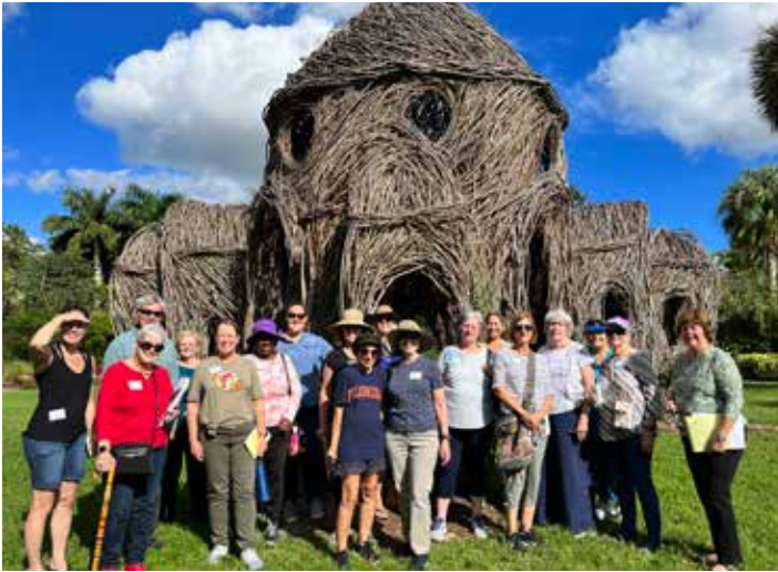
FFGC Gardening School participants at Mounts Botanical Garden on November 16th - 17th