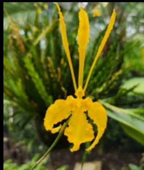
Psychopsis Marisa, quite amazing and a sequential bloomer