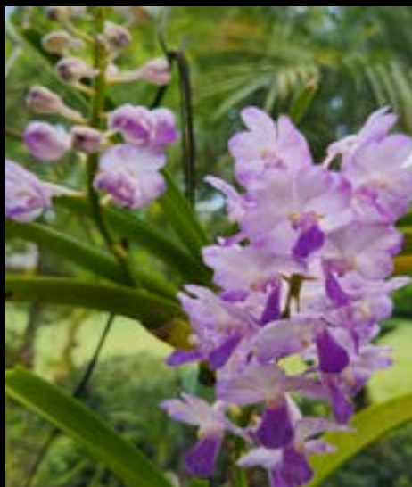
Vasca Sasicha x (Keeree San x Colestis), has a light floral fragrance