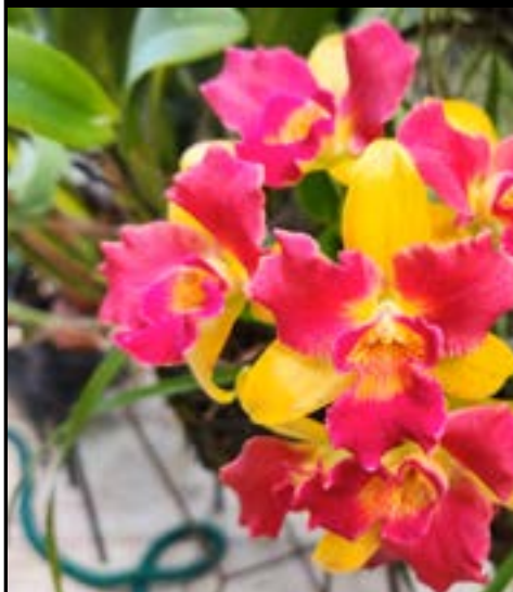
Potanara Burana beauty, also has great fragrance.