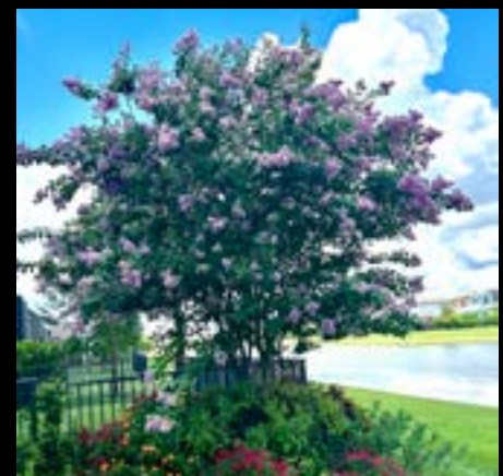
And Stormi's Crape Myrtle is really showing off.