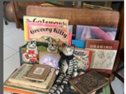
Vintage children's book collection