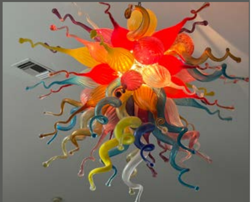
Chandelier by American Glass Artist, Dale Chihuly