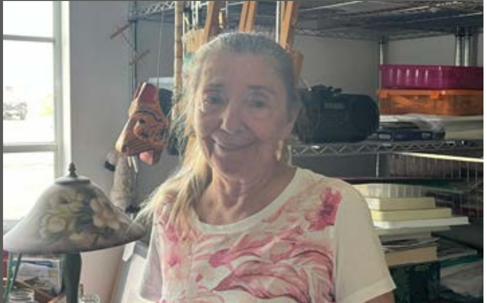
Welcome to my home and studio