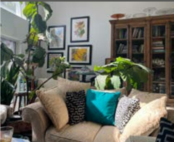
Paintings line the walls of Carol's light-filled living room