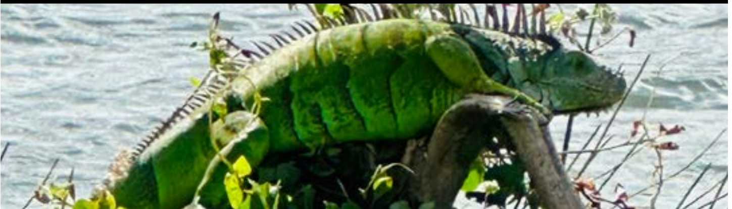
Susie Stevenson's next door neighbor