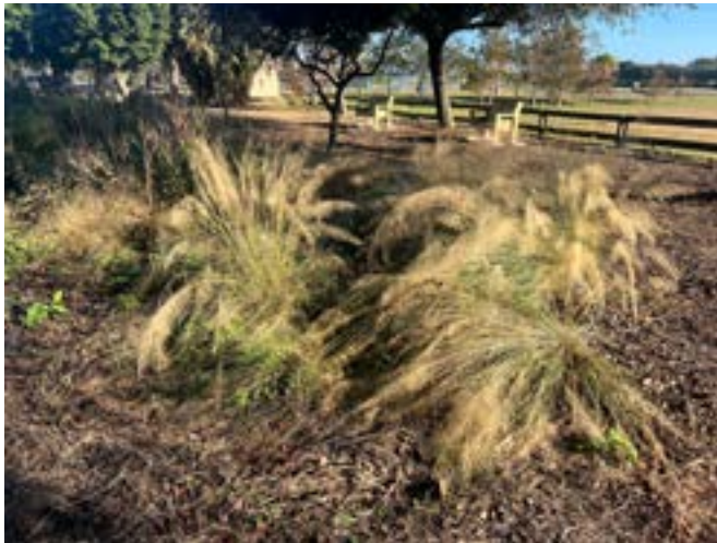
Grasses Provide Habitat in the Wildflower Meadow.

This year the Wellington Garden Club is celebrating Florida Arbor Day by planting a native tree in the Wellington Wildflower Meadow. Arbor Day is a time to inform people in the community about the value of trees and about the work done by the Wellington Garden Club to enhance the village in so many ways. Local officials will be invited, and this is a chance to thank them for supporting the environment.