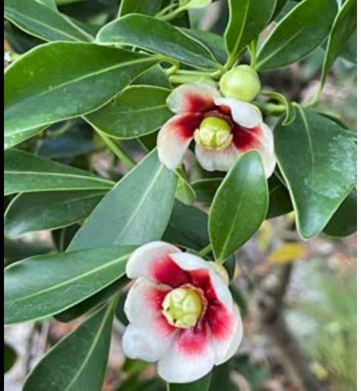
Another beauty from Diane Peaden's garden