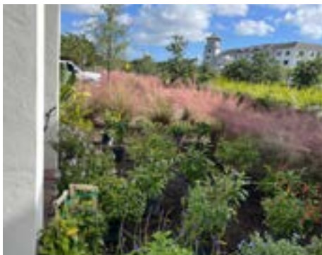
The Veterans Day Memorial Dedication to the Butterfly Garden.

November 11, 2024 WGC members met at the Patriot Memorial to walk in the parade. This year we carried our Wellington Garden Club banner and we pulled a small wagon decorated in Red, White and Blue.