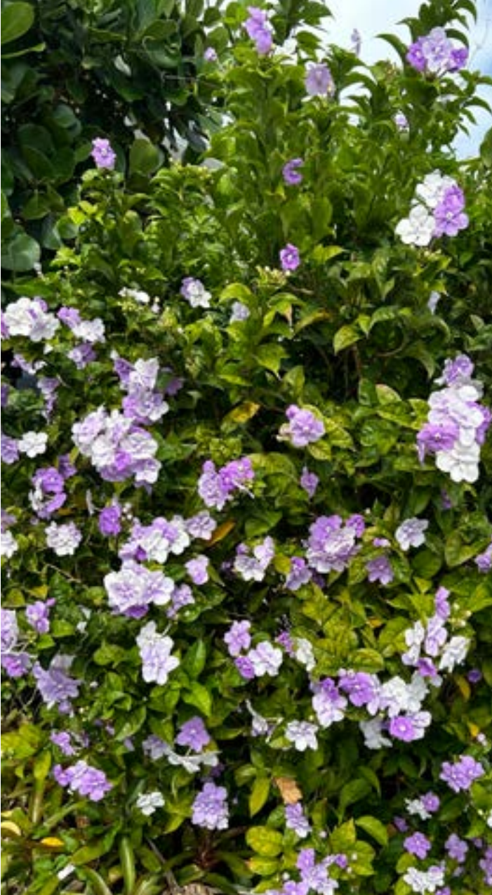
Stormi's Yesterday, Today & Tomorrow