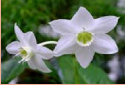
Eucharis Lily ( Eucharis Grandiflora )

We all love to find new ideas for our yards! Discovering Florida weather-friendly plants is a puzzle. New thought: consider gardening with bulbs. Not the common Crinum which does grow to awesome size. Instead try some as tiny as Rain Lilies . Just 10 inches tall, these sun lovers bloom all summer long, especially after rainy days.