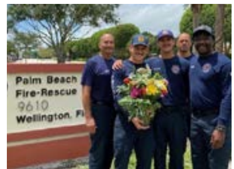
Firefighters at Station 30