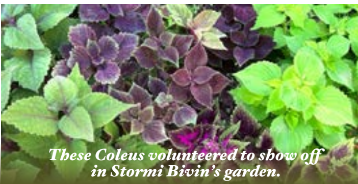
These Coleus volunteered to show off in Stormi Bivin's garden.

Anna Mae Cavaleri's native milkweed plants are topping out at 5 ft. tall!