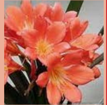
Bush Lily ( Clivia Miniata )