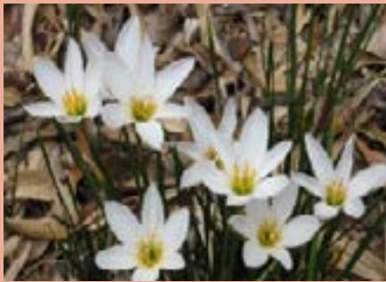
Rain Lily ( Zephyranthes )

Eucaris Lily is a marvelous shade plant and grows under those big trees. Blossoming at least twice a year with evergreen foliage, it is the perfect break from invasives! Also recommended for dappled shade, try Blood Lily, Oxblood Lily, Clivia and miniature varieties of Agapanthus, such as White Wedding Bouquet.