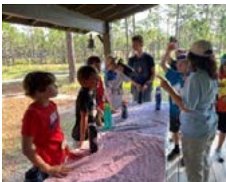
Taking a Lesson in The Nature Hut