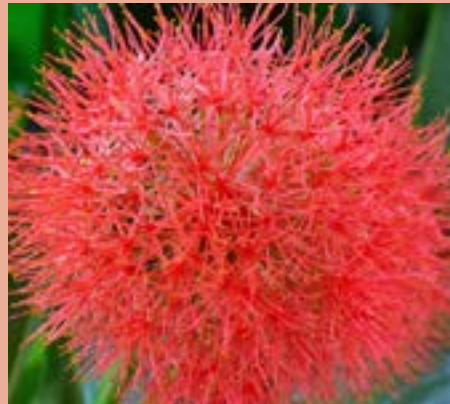
Blood Lily ( Scadoxus Multiflorus )

Eucaris Lily is a marvelous shade plant and grows under those big trees. Blossoming at least twice a year with evergreen foliage, it is the perfect break from invasives! Also recommended for dappled shade, try Blood Lily, Oxblood Lily, Clivia and miniature varieties of Agapanthus, such as White Wedding Bouquet.