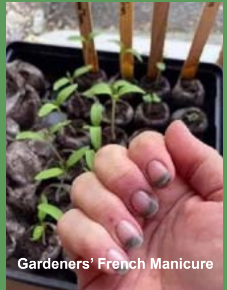
Gardeners' French Manicure