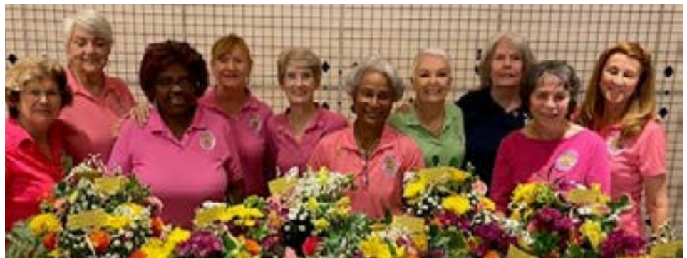
WGC Bouquet Makers