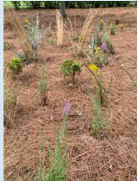
Greenbriar Meadow, mulched and ready to grow