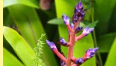
My favorite bright bromeliad in bloom

Here at home, I catered a horse show breakfast, sponsored by my daughter's new college counseling business, Alexander Academic Access. I created this summery arrangement for the table from a grocery store bouquet.