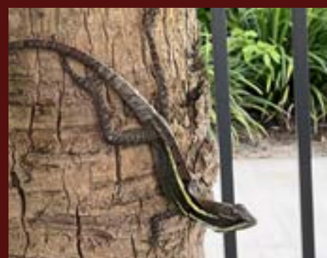
My garden visitor