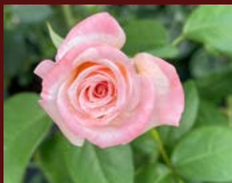
I can't believe I can grow a hybrid tea rose in south florida!