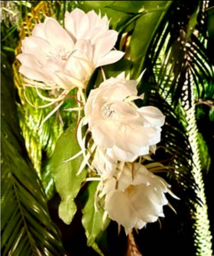
My Night Blooming Cereus...26 blooms in a single night!—Joan Kaplan