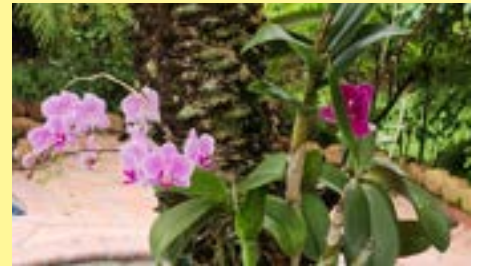
Orchids by the pool—spectacular!