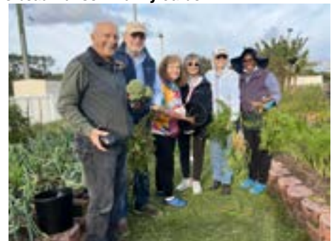
Some of the team volunteers