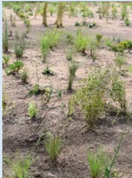
500 native plants in 4 hours