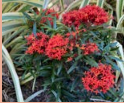
Thai Boy Ixora and below, a thornless Crown of Thorns