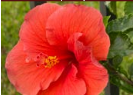
A Florida native