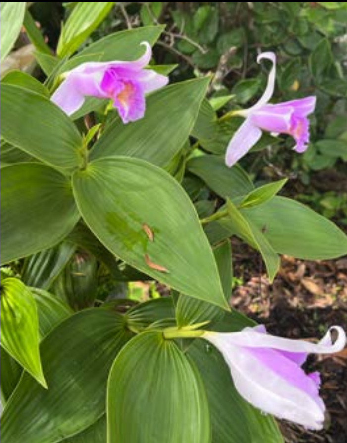
Sobralia Bradeorum aka Edwina. Blooms at sunrise, gone by sunset.