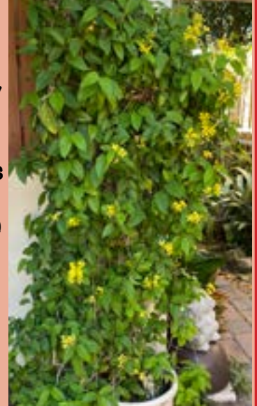
Vine version of Thryallice

Do you love the color of an Ixora but don't want the size or pruning that loses blooms? Then try the very miniature Ixora (Snow White) for semi shade –or Thai Boy Ixora, which likes semi sun but only grows to two feet in height with unique leaves and flowers.