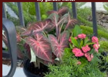
Small container garden