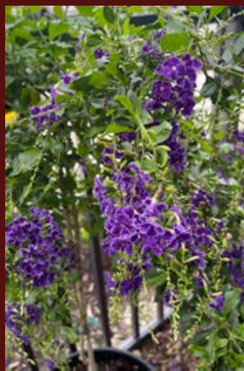
Golden Dewdrop—a new plant for me