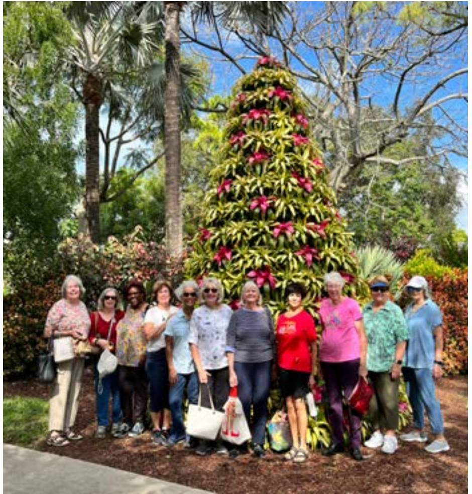
Our group enjoying the magnificent bromeliad Christmas tree