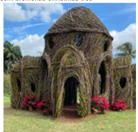
Another current exposition "Stickwork" by Patrick Dougherty.