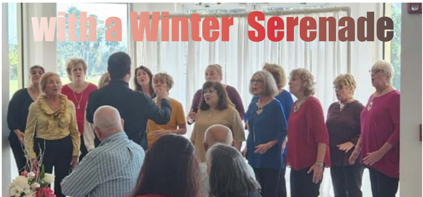
The acapella chorus, Women of Note, serenaded 96 members of the Wellington Garden Club. They sared popular and holiday tunes and their beautiful harmonies lifted our spirits.