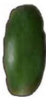
Rhipsalidopsis Easter Cactus (US)