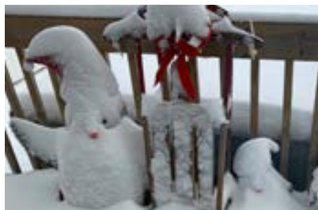
... And their cousins in snowy Ohio