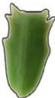
Schubertiana truncata Thanksgiving Cactus (US)