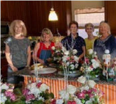
The talented group that created these lovely centerpieces