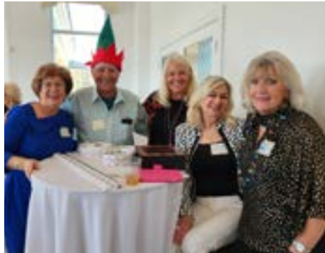
Hangin' out with the Raffle Committee