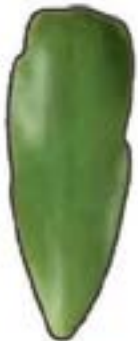
Schubertiana buckleyi Christmas Cactus (US)

how to identify CHRISTMAS CACTUS THANKSGIVING CACTUS & EASTER CACTUS