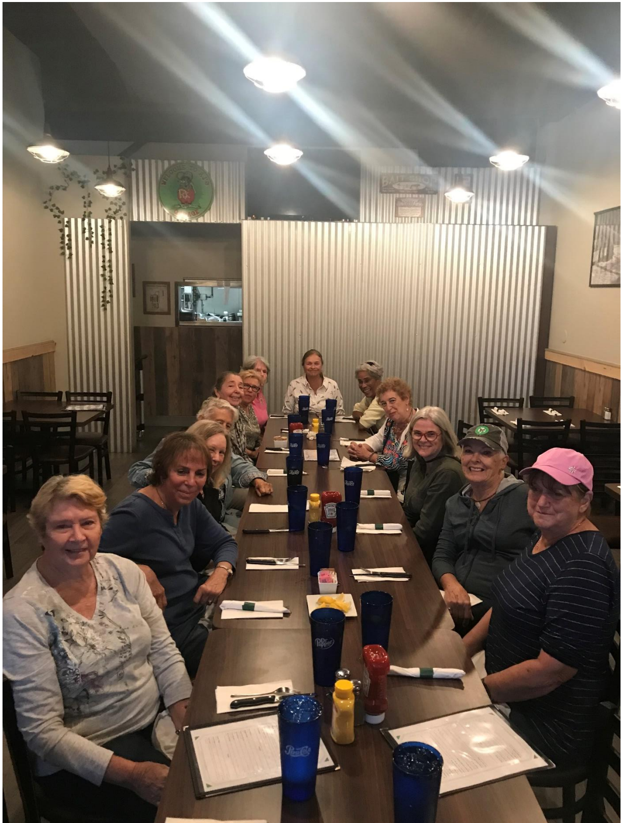
Lunch at Kocomo Grill in Loxahatchee, FL