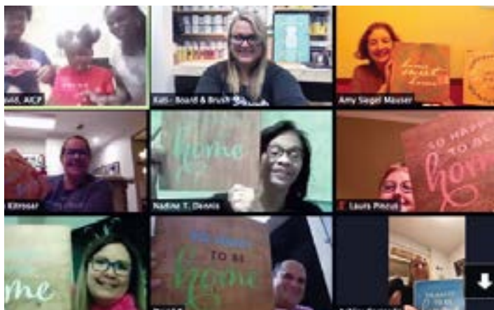
Virtual DIY Night with Wellington Board & Brush

Thank you for supporting a fundraising team or joining one or more of the events of Women Build week! Of course, we were disappointed not to be working together at the (almost) home of the Bridges Family. Next year in a pink hard hat! Peer-to-peer fundraising was a success with almost $7,500 raised by 9 teams and 67 donors.