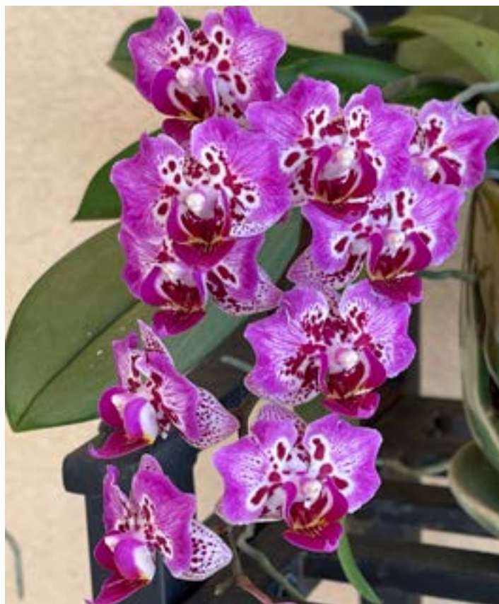
Maxine Fisher's orchid show