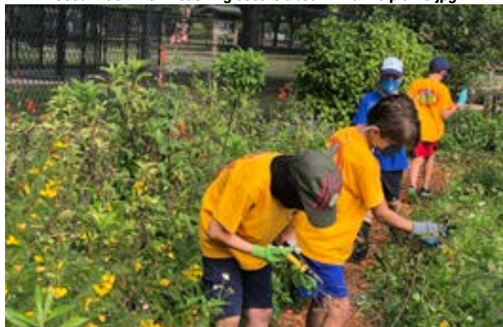
Scout Pack 125 at Butterfly Garden.jpg