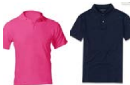
Pink Women's S M XXL

The sooner you get your order in the sooner you willl get your shirt!