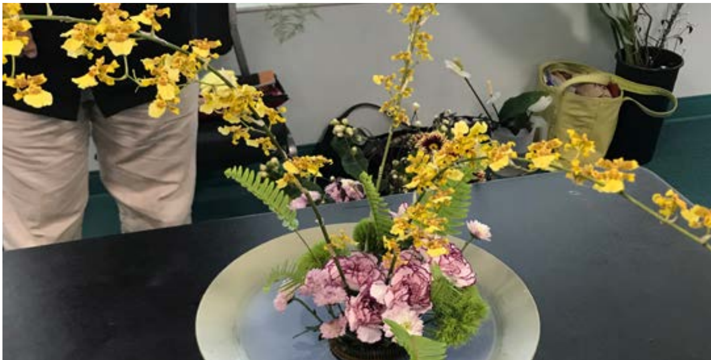
Ikebana, Japanese flower arrangement, is deeply embedded in Japanese culture and dates to the seventh century.