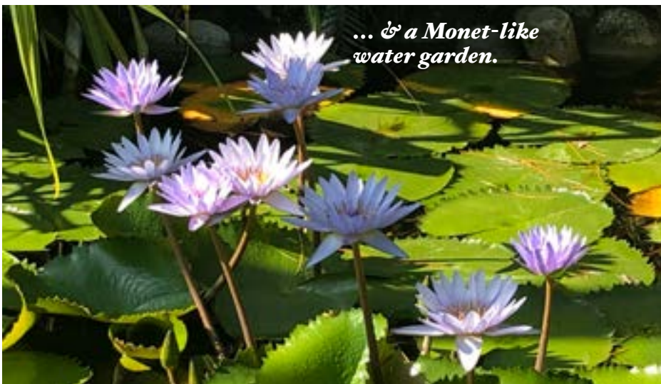
... & a Monet-like water garden.