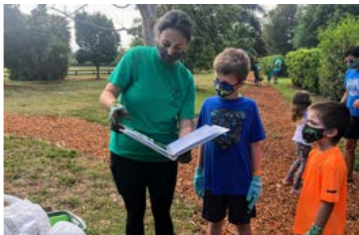
Scout Pack mom teaching scouts about FI native plants.jpg