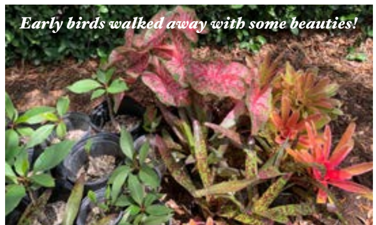
Early birds walked away with some beauties!