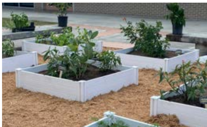
New Horizons Ele Raised Beds.jpg