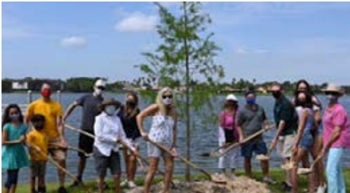
Of course we planted a tree!