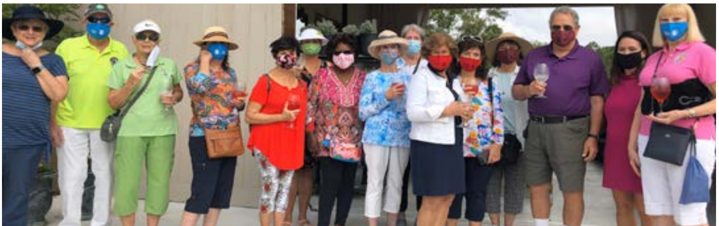
Our group sipping hibiscus tea on a beautiful February morning