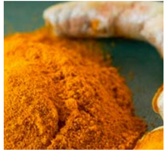
Turmeric adds color to your meals