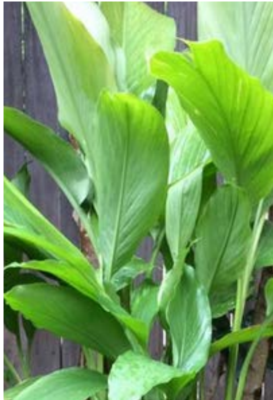
You can grow turmeric in your backyard

Curcuma longa , family Zingiberaceae, is a perennial herb plant. It has ceremonial, culinary and medicinal value. Indian food is always cooked with turmeric powder which gives strong color to the food.