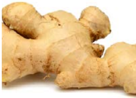
Ginger root can be dried into a powder or cut and candied. Sliced ginger can be brewed into a soothing tea

Zingiber officinale family: Zingiberaceae Known for at least 2,000 years, ginger originated in the tropical rainforests of Southern Asia. It is used as a spice, for home remedies in herbal medicine and to reduce inflammation associated with rheumatoid and osteoarthritis. It is an antioxidant, anti-viral and is used to treat nausea, motion sickness stomach cramps, fevers and colds. Include ginger, raw or cooked in your diet. It is especially comforting as a tea.