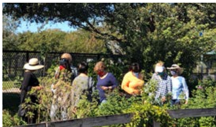
It was a lovely day to tour our gardens