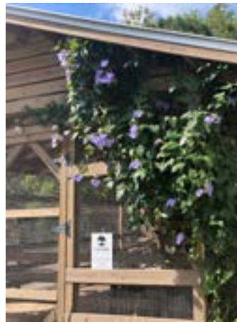
Outside and inside the goat palace