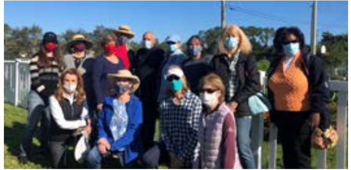
WGC Members during Around & About on January 6, 2021

It is never too late to volunteer. Contact each of the chairmen for questions or interest.