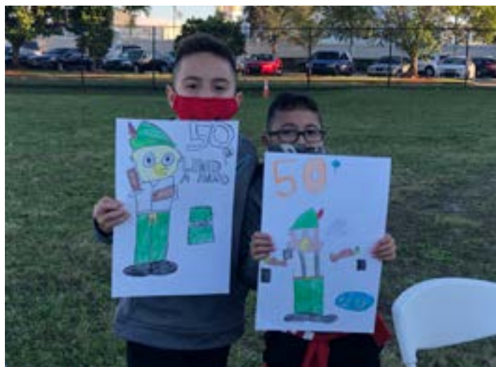
Woodsy Owl Poster Contestants