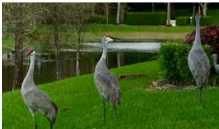
Twig's backyard buddies—Mom, Dad and Juvenile. Did you know young sandhills are called 'colts'?