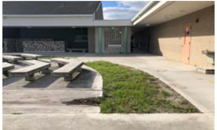
New Horizons Elementary Future Garden Area