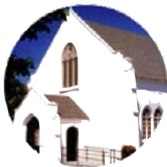
St. Patrick's Episcopal Church West Palm Beach