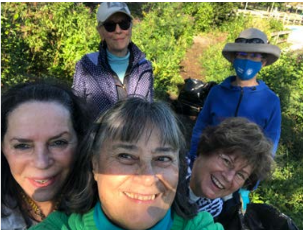
Butterfly Garden Clean-up Crew December, 2020

We plan to start building the new butterfly garden in early 2021.