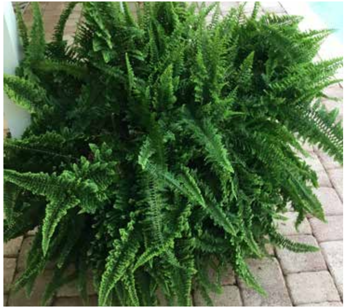
My fern, Nephrolepis "Susie Wong"