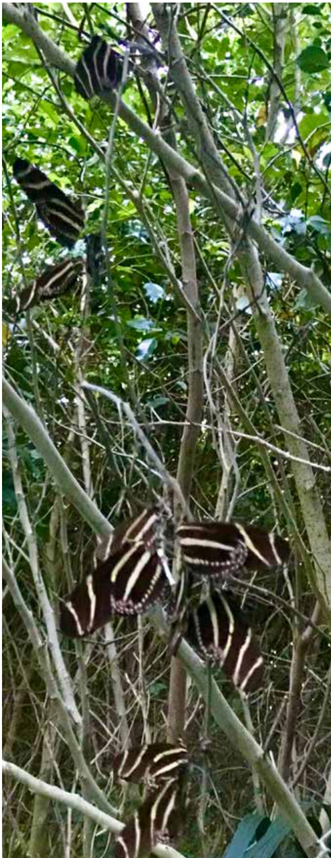
My Zebras getting ready to go to sleep.