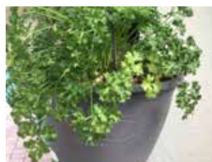
I also grow my parsley in a hanging pot!