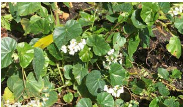
Begonia Odorata Alba