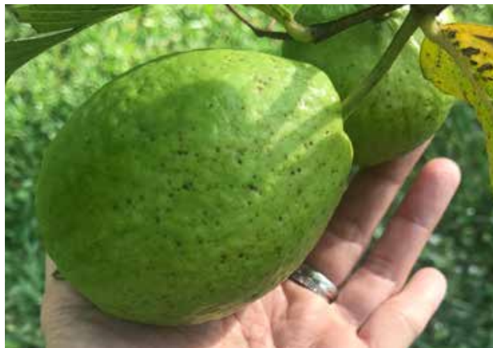
Mmmm... A guava right off the tree!