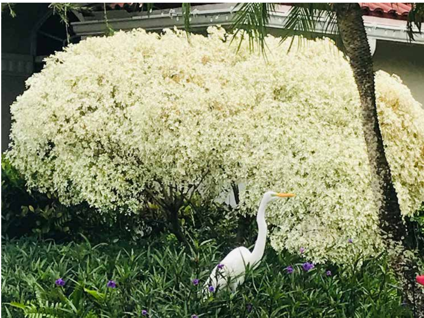
This amazing bush puts on a show in December and January.