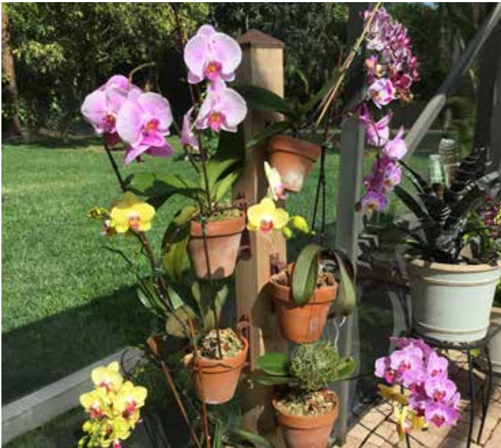
Such a fun time for orchids!