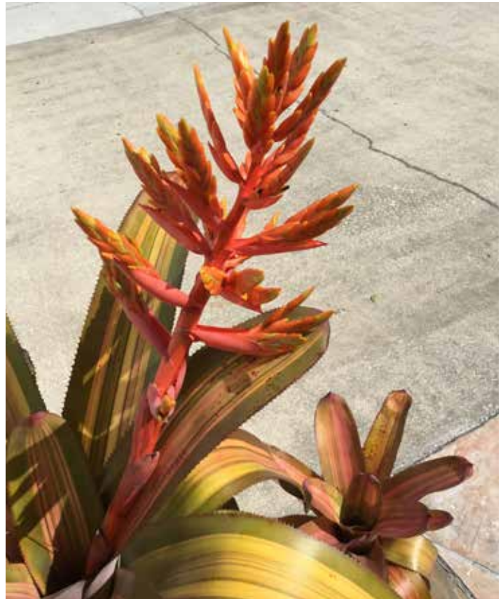
Aechmea Bromeliad (a hybrid of "Patricia")