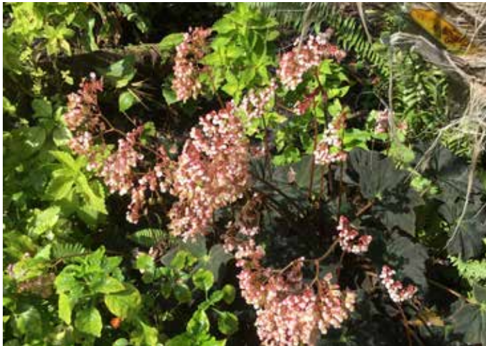
Begonia "Arabian Sunset"