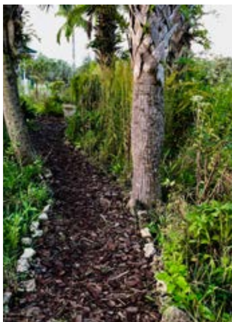
Early morning in the garden