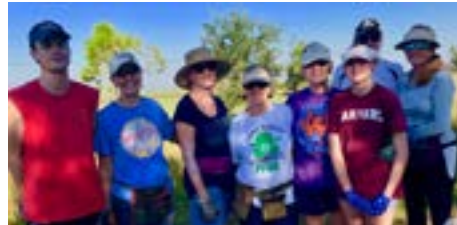
Our fabulous WGC volunteers

Thank you to all our volunteers who helped make this tree planting event a great success. Mark your calendars now for next year's 7th Annual Tree Planting on National Public Lands Day, Saturday, September 26, 2020.