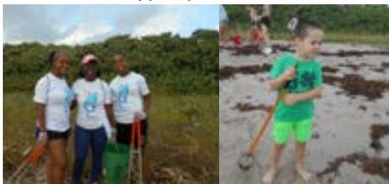
Our youngest volunteers