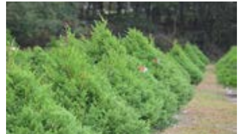
Red cedar trees ready for planting