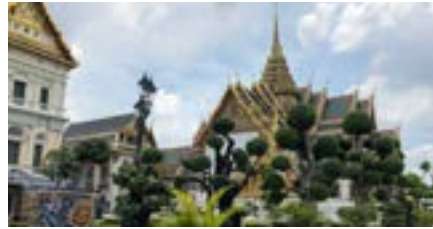
Grand Palace in Bangkok