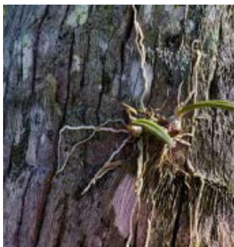
The orchids we planted last year are really taking off