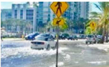
Daily flooding in Miami