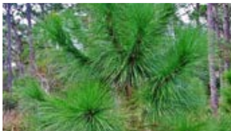
Florida South Slash Pine