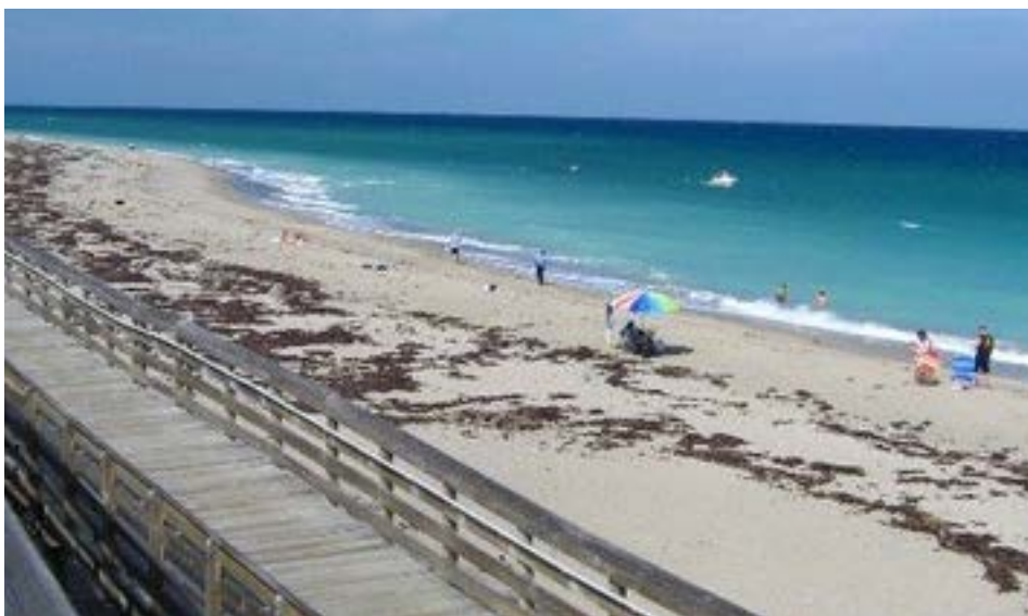
John D. MacArthur Beach State Park preserves the subtropical coastal heritage that once covered South Florida