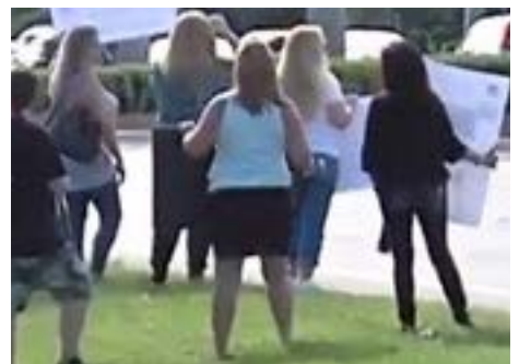
Protesters VOW Council Meeting on October 7