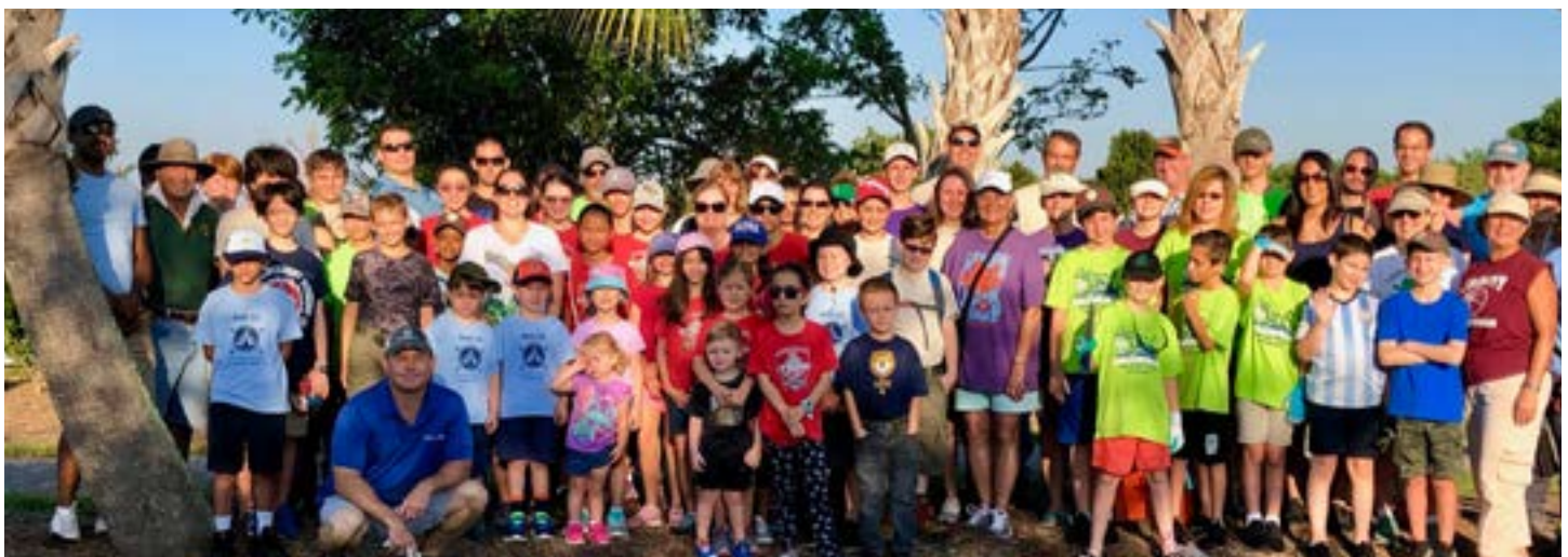
Our wonderful volunteers included WGC members, scouts and their parents and families and church friends