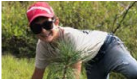
Boy Scout Troop 125 volunteer planting pine seedling