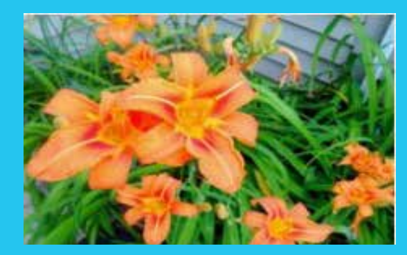
... to this!