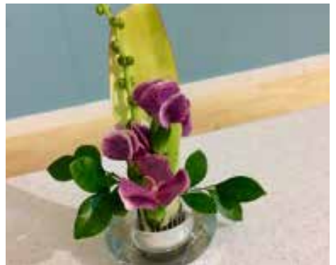
Two great examples of petite floral design

Questions? Contact Chris Biscoglio: 2us@comcast.net