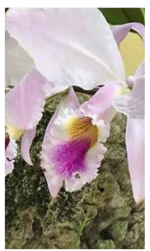
How beautiful is this?