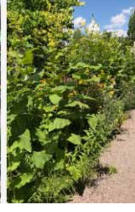
Established by the U.S. Congress in 1820, the U.S. Botanic Garden is one of the oldest botanic gardens in North America. Since 1934, it has been administered through the Architect of the Capitol.