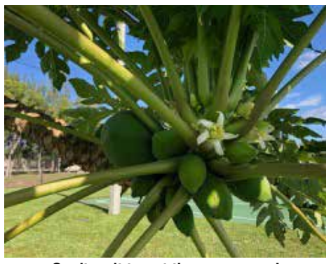
Can't wait to eat these papayas!