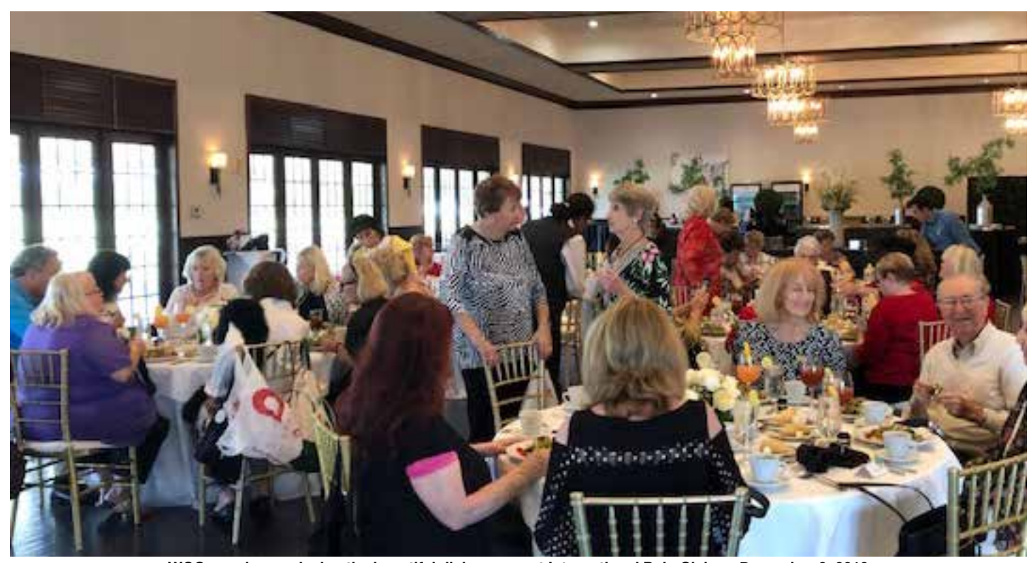
WGC members enjoying the beautiful dining room at International Polo Club on December 2, 2019