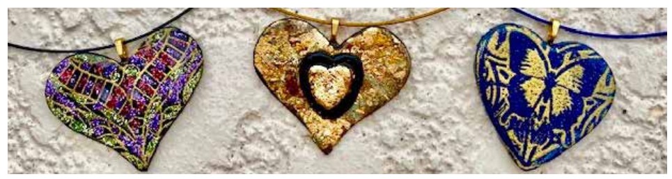
Let's make polymer clay heart pendants

Thursday, February 6 9:00 AM-1:00 PM Fire Station 30 9610 Stribling Way