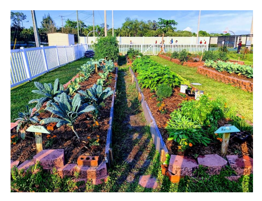
Growing Season in the Garden