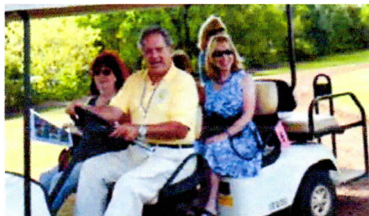
Tom's golf cart