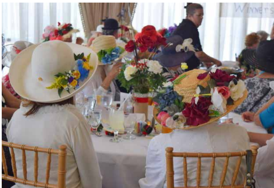
Ladies Who Lunch