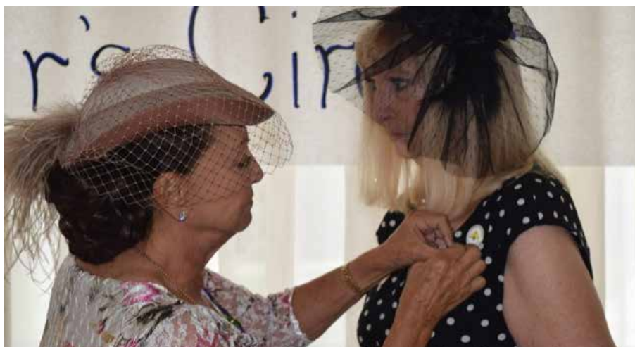
The Changing of the Guard