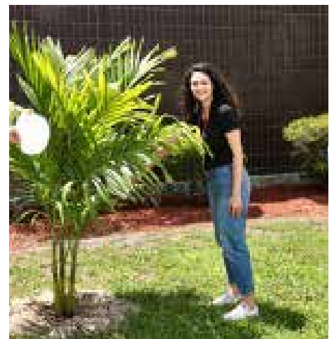
Wellington HS gardeners planting Christmas Palms