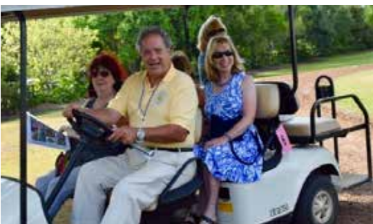
Tom's golf cart