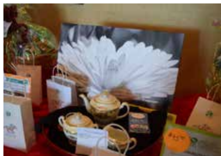
Goodies on the Raffle Table