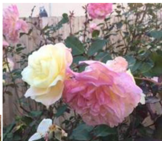
This rose starts out yellow & ends up pink. —Deb Russell