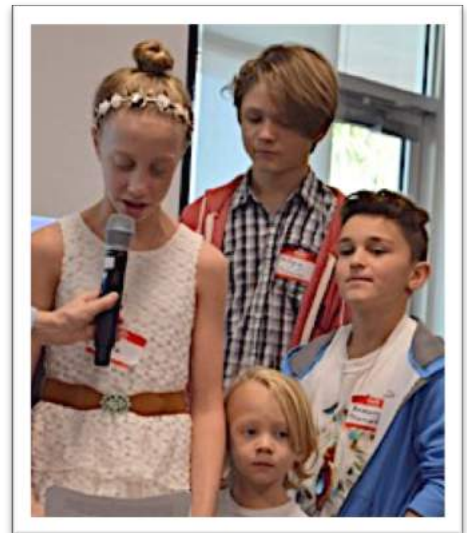
Campers at the January Meeting