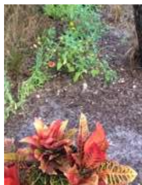
Before & After —Bobbi Ziegler