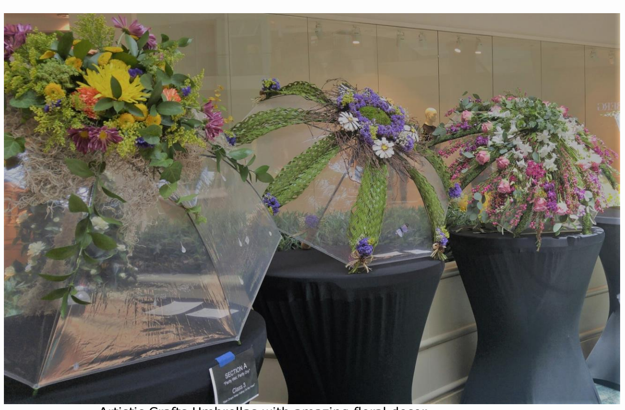
Artistic Crafts Umbrellas with amazing floral decor