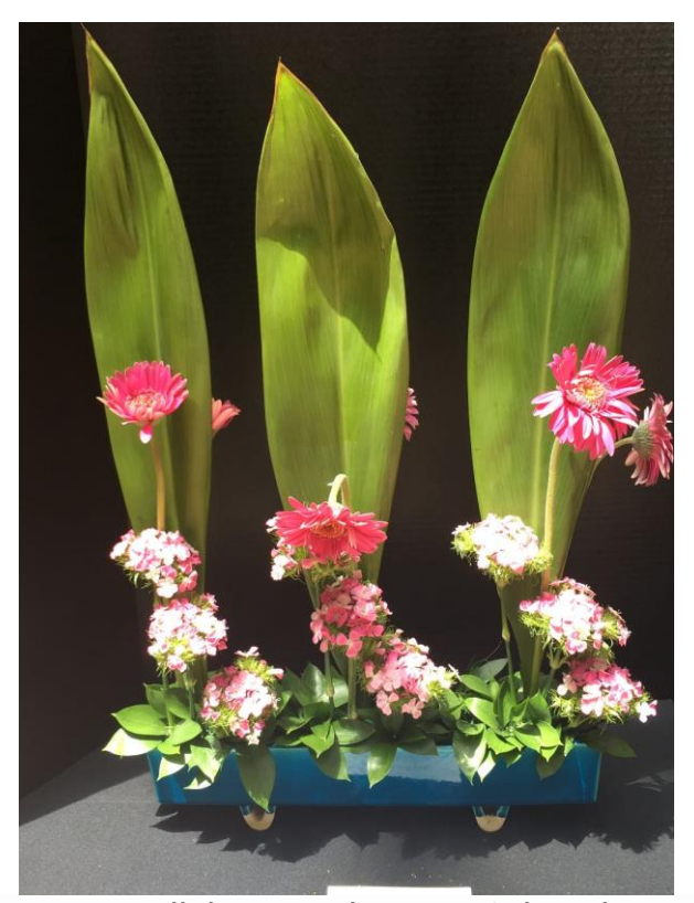
Parallel Design by Amy Schwed