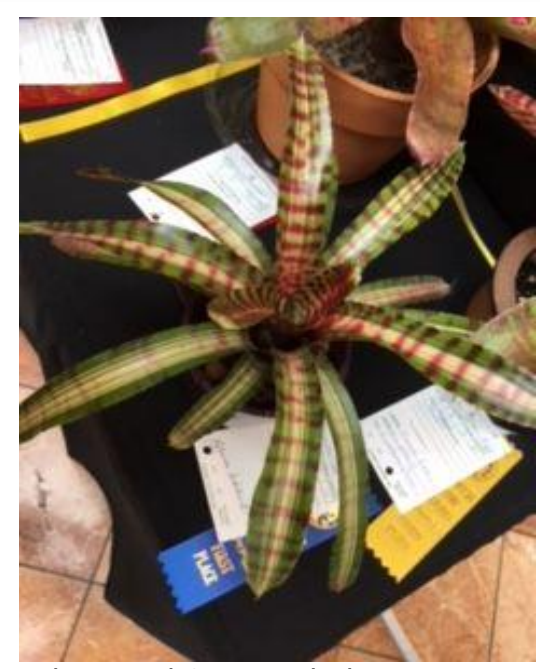
Janet Seagrave, 2 of 3 winners. First Place and 2 second places.