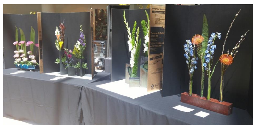
Four different interpretations of parallel designs