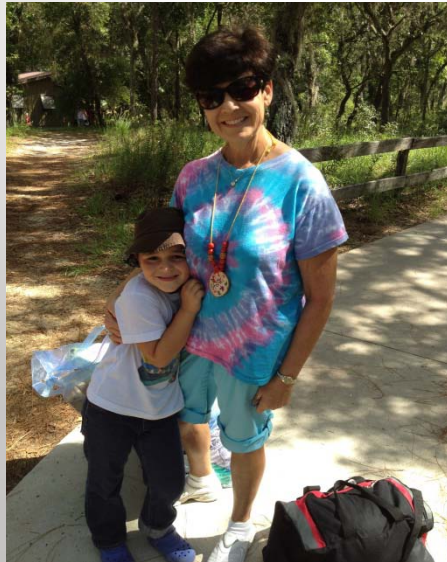
Critter Camp - 2015