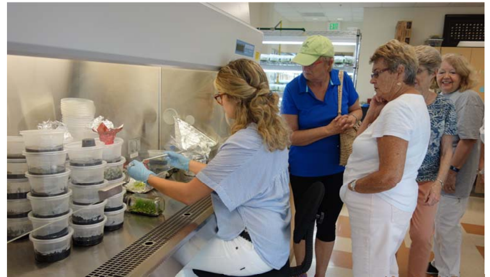
Two of their lab workers.