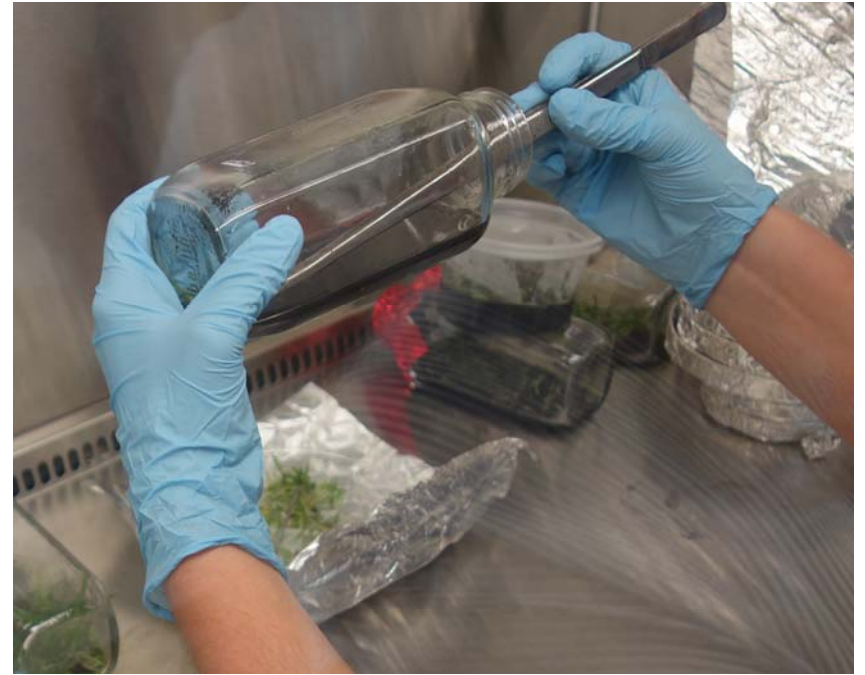
Orchids are grown in a sterile environment.