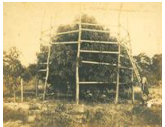
Elbridge Gale next to his mango trees