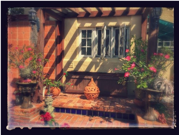
Tranquil sitting area in Pam's garden

On March 30th 20 members of the WGC went on a mini "Around and About" garden tour on Palm Beach Island, which was totally free, to visit with Polly Reed and her fabulous piece of paradise located at 231 Chilean Ave. She was so gracious in explaining her way of doing things with her plants and even allowed us to tour inside her house! After that, we crossed back over to West Palm to visit Pam Bohm's garden located in Flamingo Park historic district, 728 Avon Road. If you recall, Pamela was our February speaker. We got to see her beautiful garden and all the great things she has done. She then escorted us over to William Brady's garden, her neighbor, also located at 713 Avon Road, Flamingo Park. It was another piece of heaven! These gardens