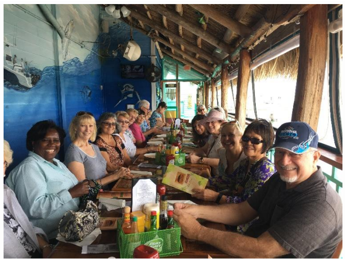
Lunch at the Tiki along the Indian River