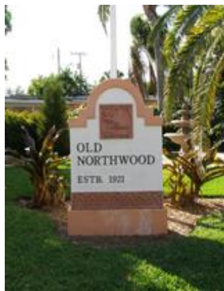
Sign of historic West Palm Beach