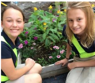
Can you find the caterpillar? Hint: it's not on the plants.

Binks Forest Elementary - The courtyard butterfly garden project of this junior garden club is almost completed! Students are continuing to add paver pathways, mulch and butterfly plants; the garden is blooming with flowers, caterpillars and butterflies!