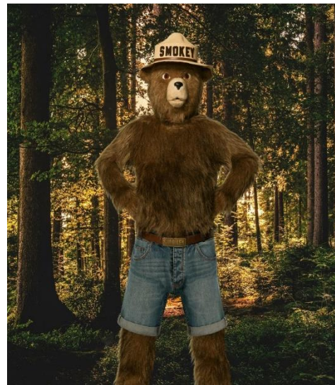
Smokey Bear donning cool denim shorts ready for hot summer days!