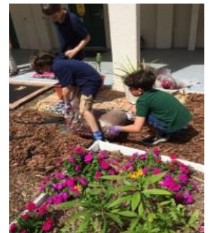
The Mulch Mavens

Binks Forest Elementary - The courtyard butterfly garden project of this junior garden club is almost completed! Students are continuing to add paver pathways, mulch and butterfly plants; the garden is blooming with flowers, caterpillars and butterflies!