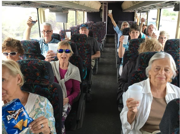
On the bus headed for home.....

Hip Hip Hoorah for WGC Around Abouts!!!!