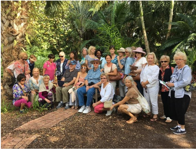
The Gang's all here!