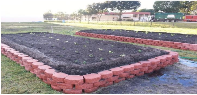
Two of four raised beds under construction by community leaders

The new Community Garden project is moving along at full steam with diligent and hard-working WGC volunteers. This new effort involves several parts of the community. The idea of having a Community Garden was created by the Young Professionals of Wellington several months ago. With the help of the Village of Wellington and several other charitable organizations, four very large raised beds were constructed on the Village-owned property behind the Boys and Girls Club of Wellington on Wellington Trace. With