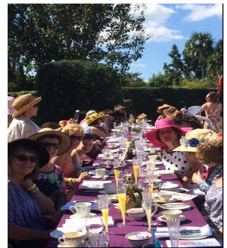
High Tea Luncheon on the lawn at Mounts – those are Mimosas on the table!