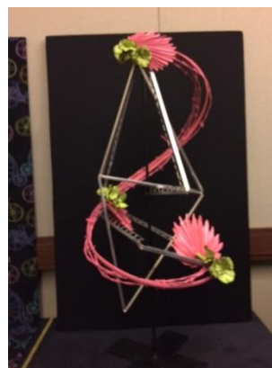
Design depicting roadside treasures using items from a dumpster