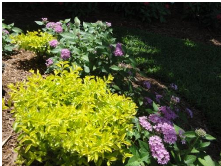
Vivid color at Stormi & Tom Bivin's Back Yard Haven