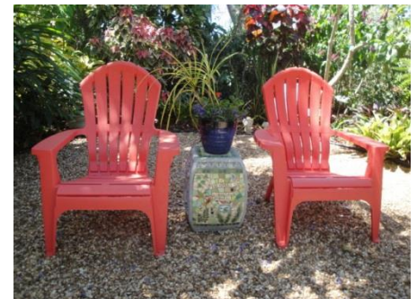
Time to relax at Laure & Plamen Hristov's garden