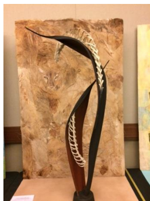
Design with palm spaths and woven palm fronds