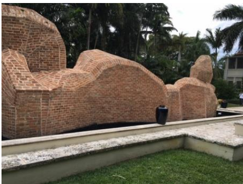
Your guess is as good as ours!

Many members ended the afternoon with lunch at restaurants of their own choice.