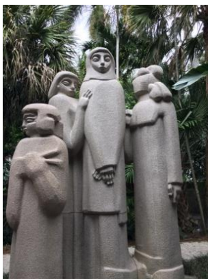
We think they might be Mexican or South American