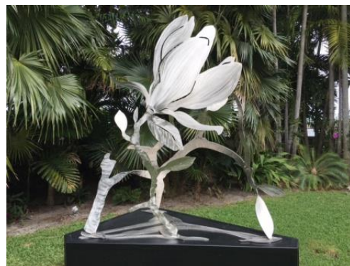
Silver Magnolia Blossom