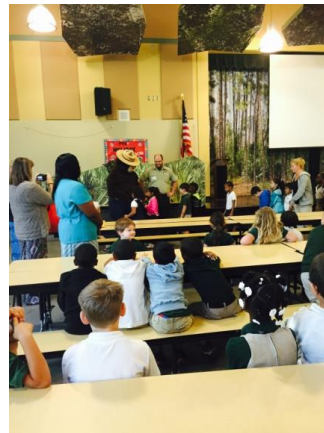
Smokey Bear at Pine Jog Elementary