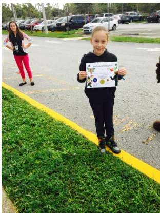
1 ST place winner of Smokey Poster Contest