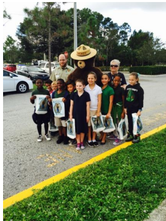
Pine Jog contest winners w/Smokey Bear & Ranger