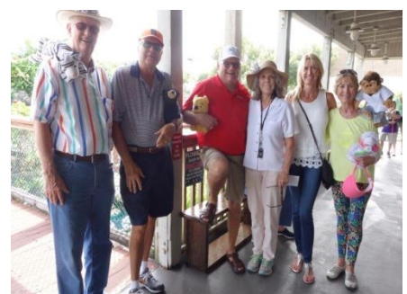
All those with a hole-in-one