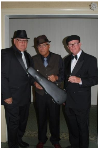
A trio of dapper gents