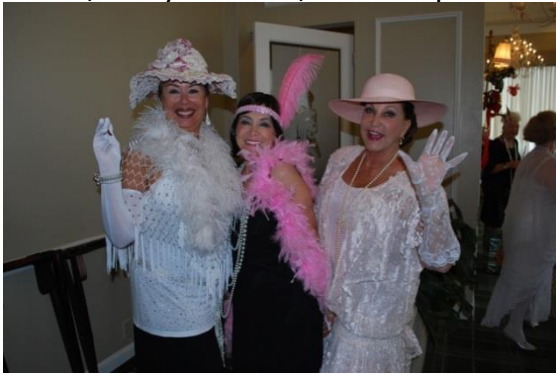
Making a dramatic entrance