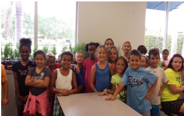
Wellington kids at Village Park summer camp