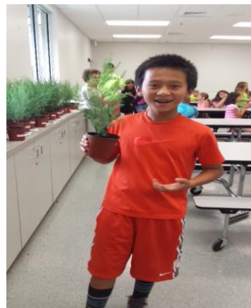
A camper proudly displaying his newly-planted red cedar seedling