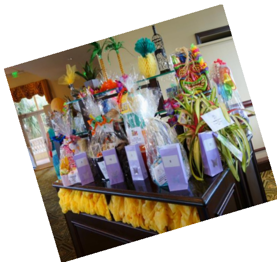
Beautiful raffle baskets for lucky winners