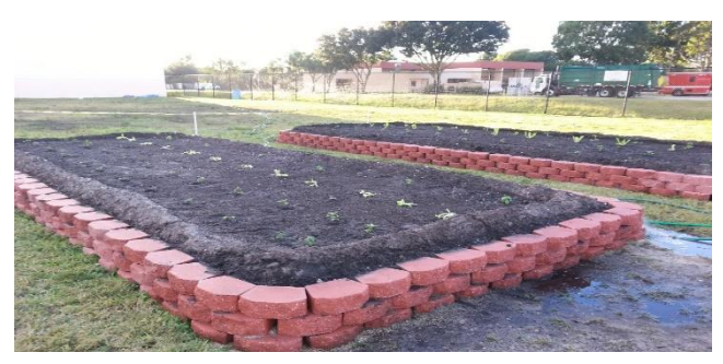
Two of four raised beds under construction by community leaders

The new Community Garden project is moving along at full steam with diligent and hard-working WGC volunteers. This new effort involves several parts of the community. The idea of having a Community Garden was created by the Young Professionals of Wellington several months ago. With the help of the Village of Wellington and several other charitable organizations, four very large raised beds were constructed on the Village-owned property behind the Boys and Girls Club of Wellington on Wellington Trace. With