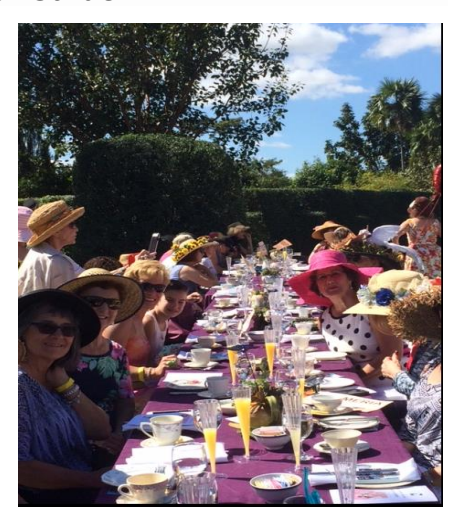
High Tea Luncheon on the lawn at Mounts – those are Mimosas on the table!