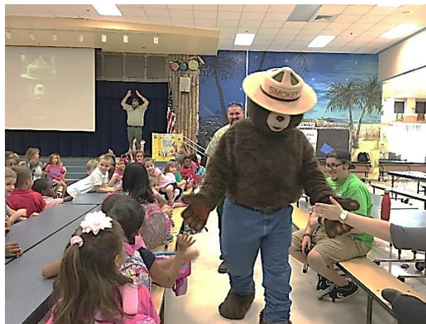
Equestrian Trails Elementary School Smokey Bear Presentation October 2016.